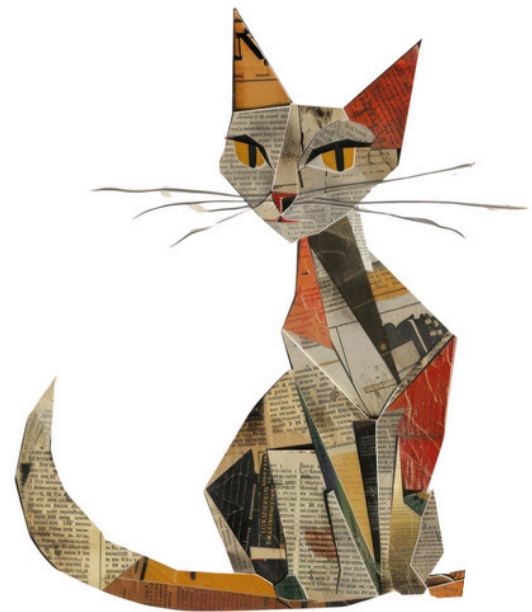
Special Thanks To

Registration is for all dates. Participants are selected by lottery. See CDBG page for lottery details.